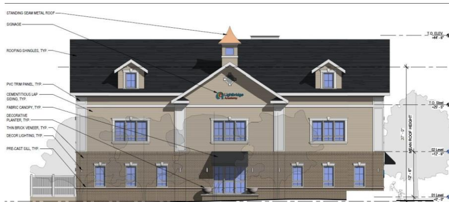
2 PLAN NORTH FROM PARK STREET 1/8" = 1'-0"